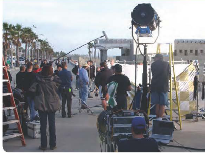
California's movie and video industry employment Primary establishments and independent production

California finally passed a film incentive program in 2009 (though it is more restrictive than other states' programs and specifically excludes big-budget films). Early data from FilmL.A., which coordinates permits for on-location shooting, shows a solid increase in production days in Los Angeles for the first two quarters of 2010. This fledgling rebound is attributable to both the new state incentives and general economic recovery from the slump of 2009. It's a positive sign—but it would be premature to conclude that the battle is won.