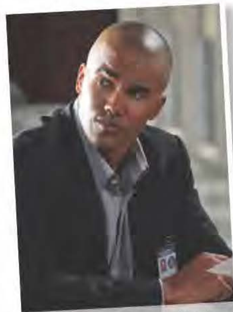
Shemar Moore of CBS' Criminal Minds

For more on SAG’s Affirmative Action & Diversity efforts, visit SAG.org/diversity .