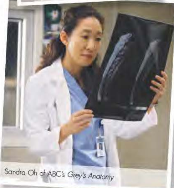
Sandra Oh of ABC's Grey's Anatomy