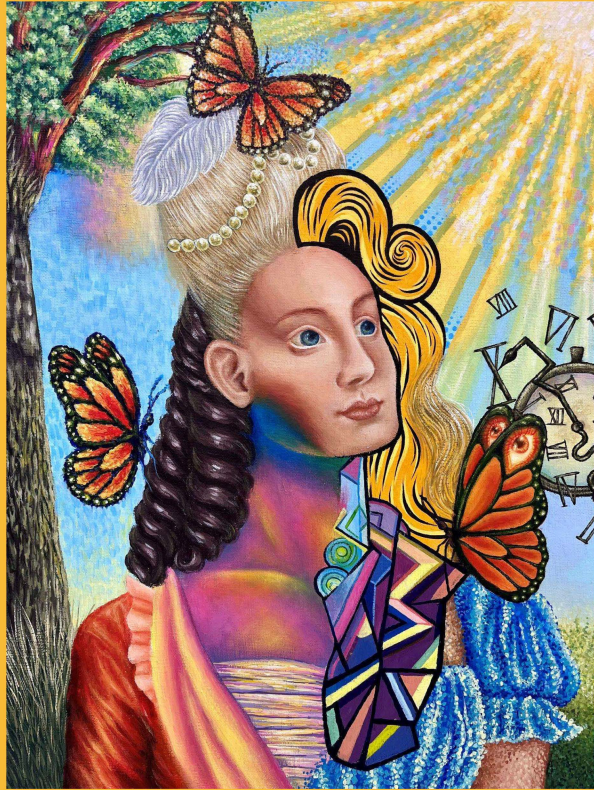
Kimberly R Imperial County