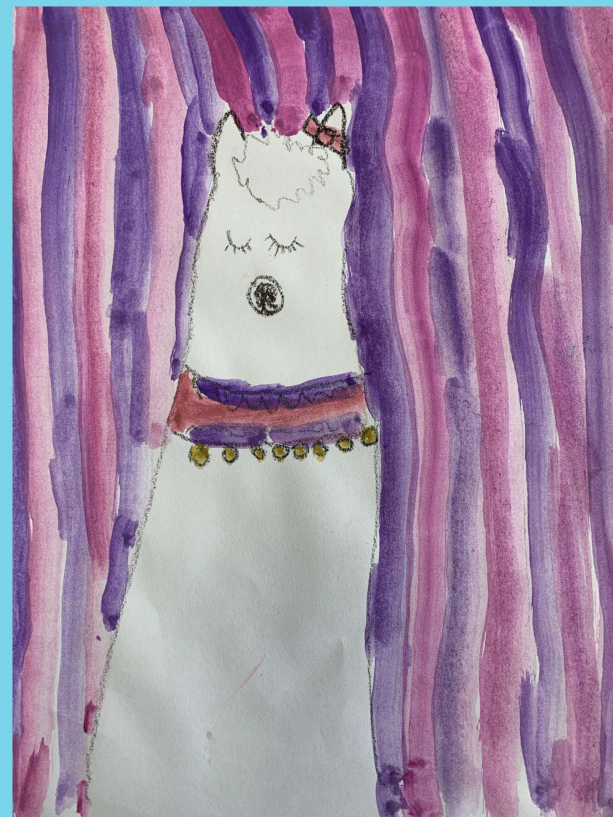
Marley R. San Diego County

Five districts created dedicated positions to lead arts education implementation districtwide